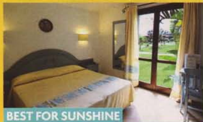
BEST FOR SUNSHINE