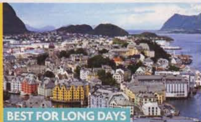
BEST FOR LONG DAYS

DON'T miss the fantastic spa treatments, especially the Steinolbad bath in shale oil.